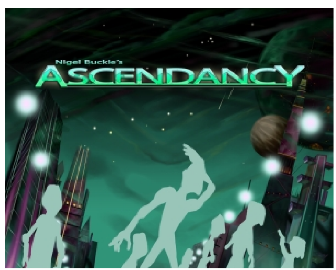
JKLM Games brings you three new games. So is it going to be fighting aliens, building the Great Wall of China, or buying and selling Tulips?